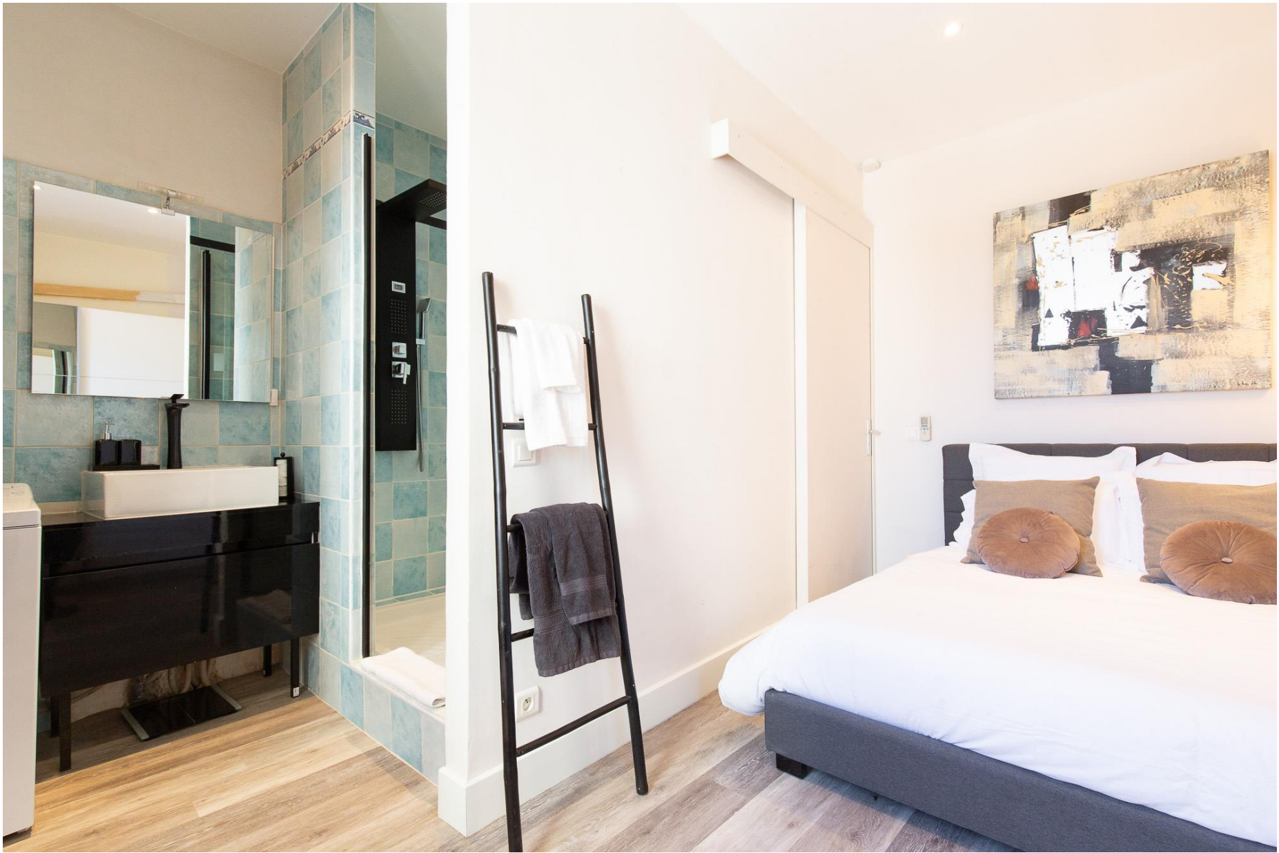
The shower room