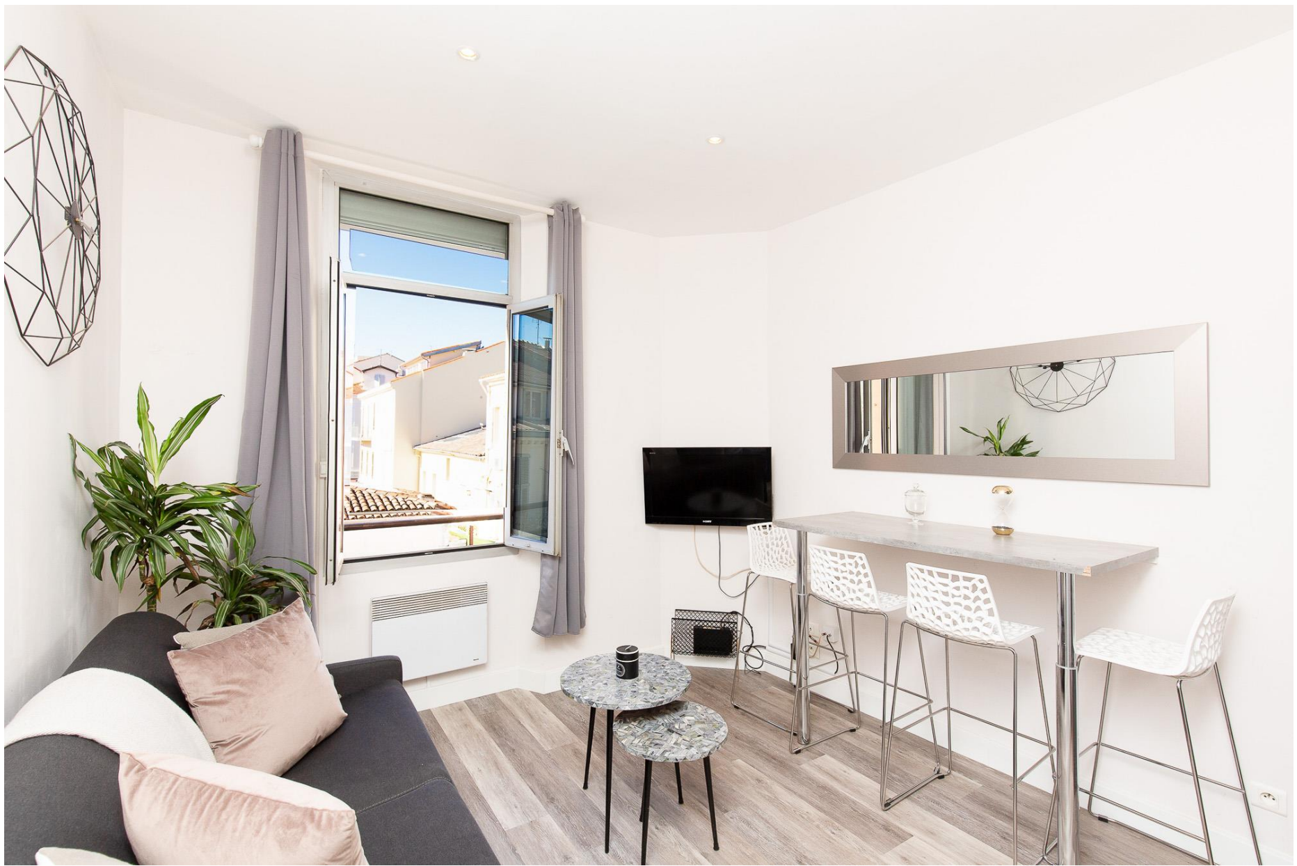
The living room, flat screen TV & dining area