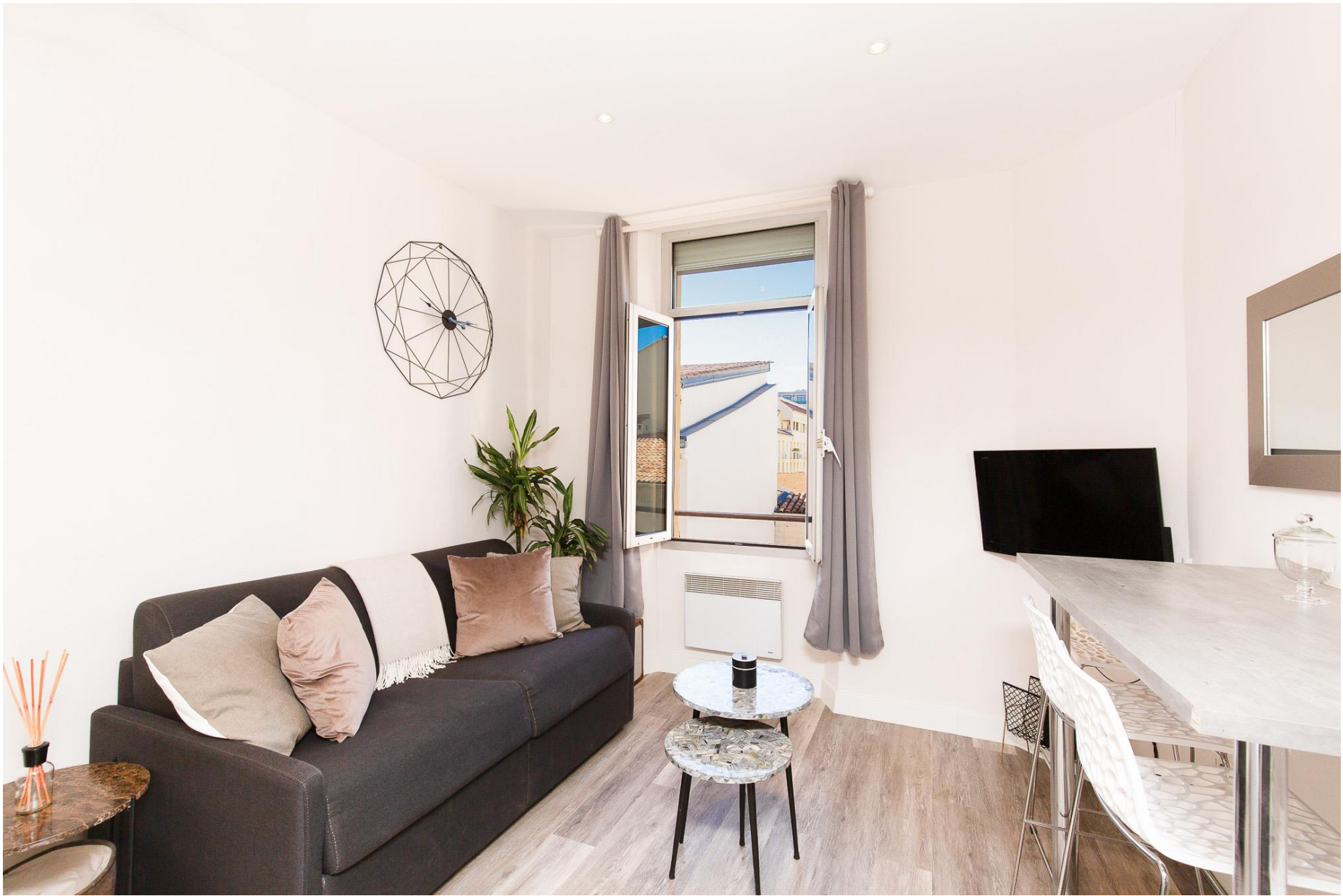
Another view of the living room