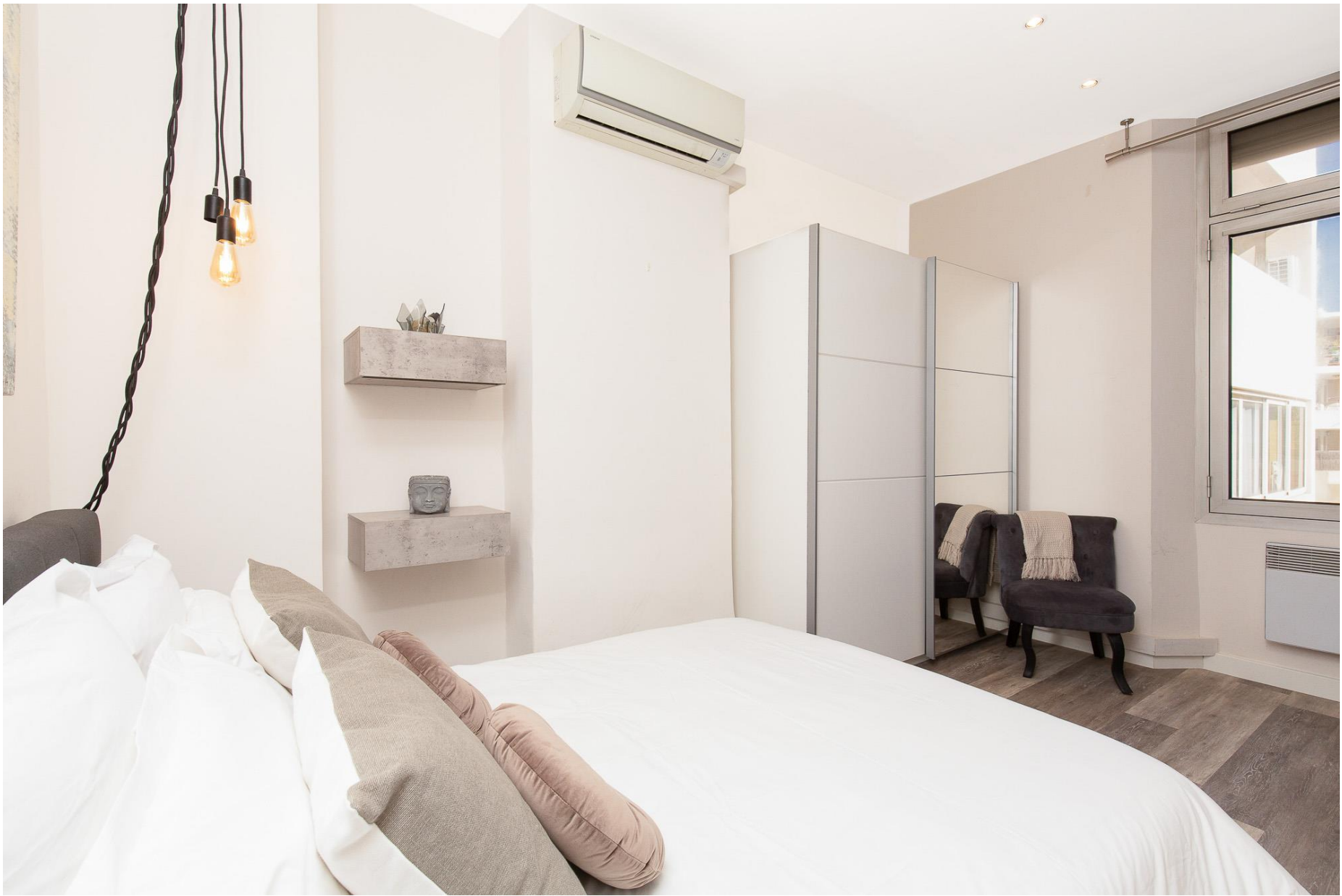
Another view of the bedroom with large cupboard