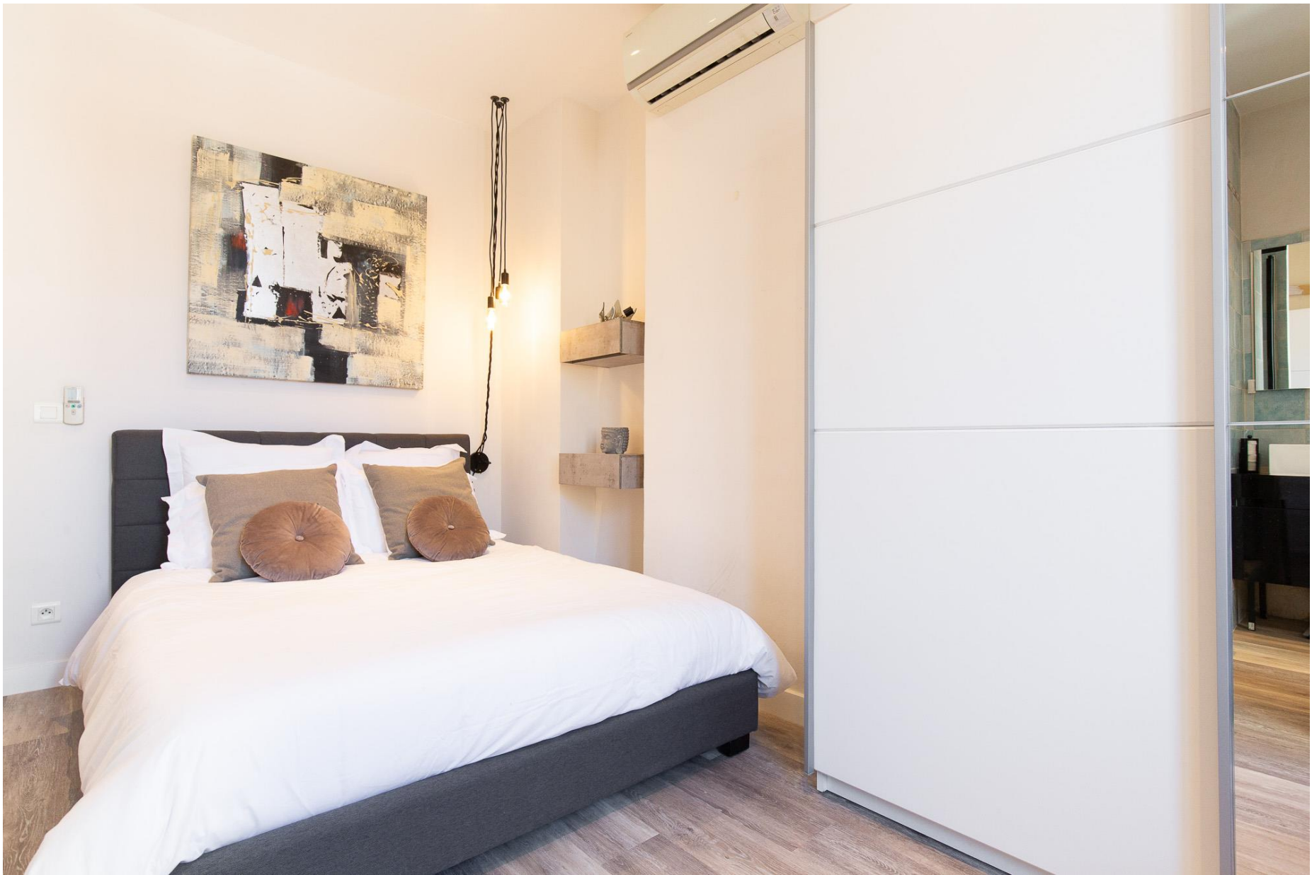
The bedroom with large cupboard